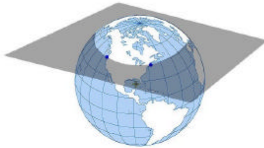
Plane and Earth Constant Latitude Plane of a Parallel

As an example, consider the paths between Portland Oregon and Portland Maine. Both are at about 45 degrees North. Look at the plane that is perpendicular to the z-axis and intersects the earth at 45 N.